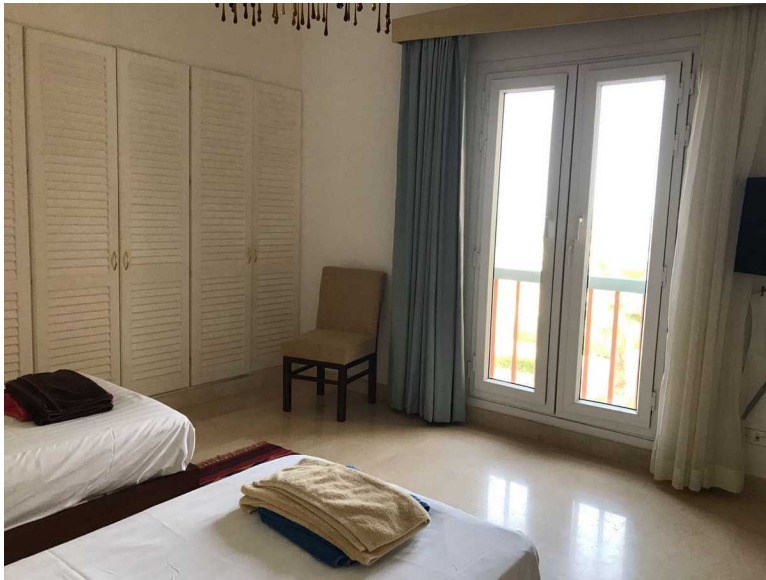
2 nd bedroom with twin beds and built-in cupboards