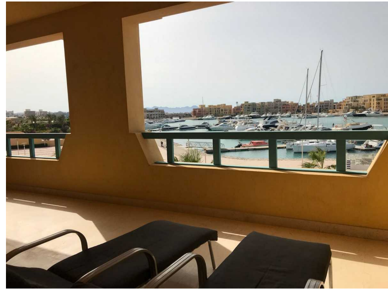
Terrace with sitting area, chaiselongs and a beautiful view over the new Marina