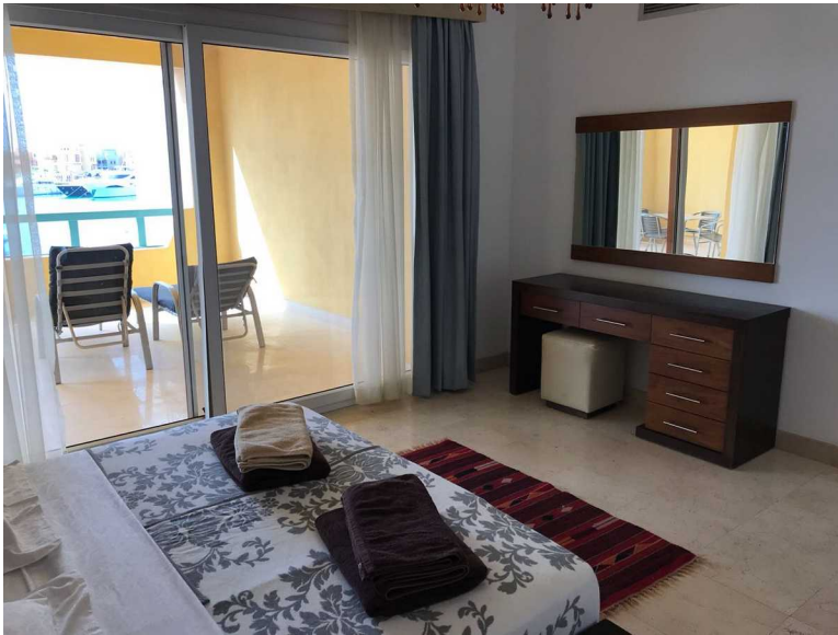
Master bedroom with king size bed and built-in cupboards (safe available)