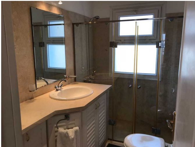
2nd bathroom with shower and toilet